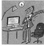
2 f i _____ work