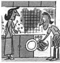
5 d _____ housework