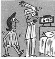
1 get _____ up