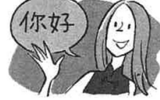
4 _____ Chinese