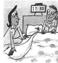
8 g _____ to bed