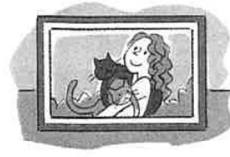
2 _____ two cats