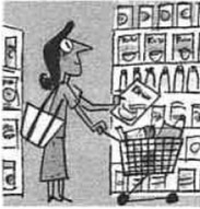
3 g _____ shopping