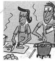
6 m _____ dinner