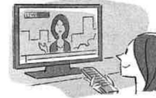
3 _____ TV in the evening