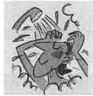
4 h _____ a shower