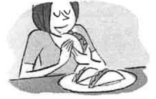
5 _____ Mexican food