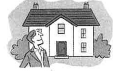
10 _____ in a house