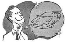
7 _____ a new car