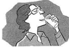
1 drink milk

drink eat have listen to live read speak want watch work