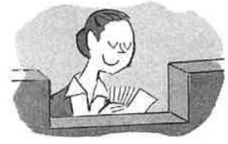
9 _____ in a bank