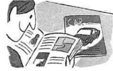
6 _____ magazines