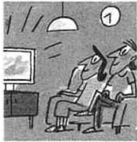
7 w _____ TV