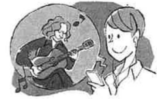
8 _____ Brazilian music