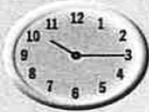
a quarter past ten